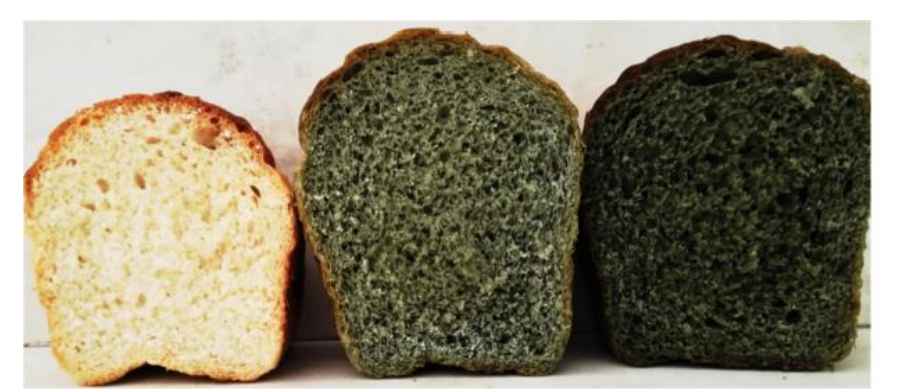
Figure 3. Gluten-free bread made from rice flour with A.platensis added instead of wheat flour (Zlateva and Chochkov, 2019).