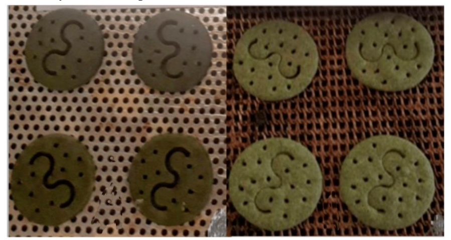
Figure 2. A. platensis added biscuit (Gün et al., 2022).

Furthermore, the incorporation of A. platensis into fermented dairy products, such as ayran, showcases its potential in augmenting both the nutritional and functional attributes of such food items (Beheshtipour et al., 2013). The growth and vitality of probiotic microorganisms are improved and their probiotic potential and nutritional value are increased when A. platensis is added to probiotic-fermented milk products (Figure 4) (Çelekli et al., 2020). This symbiotic relationship enhances the nutritional profile of ayran and highlights its probiotic effectiveness, providing consumers with a convenient and health-promoting beverage option (Çelekli et al., 2020). All things considered, the various ways that A. platensis is used in functional food recipes highlight how important it is as a nutrient-dense, sustainable ingredient that can help with a range of dietary needs and promote overall health (Birch and Bonwick, 2019).