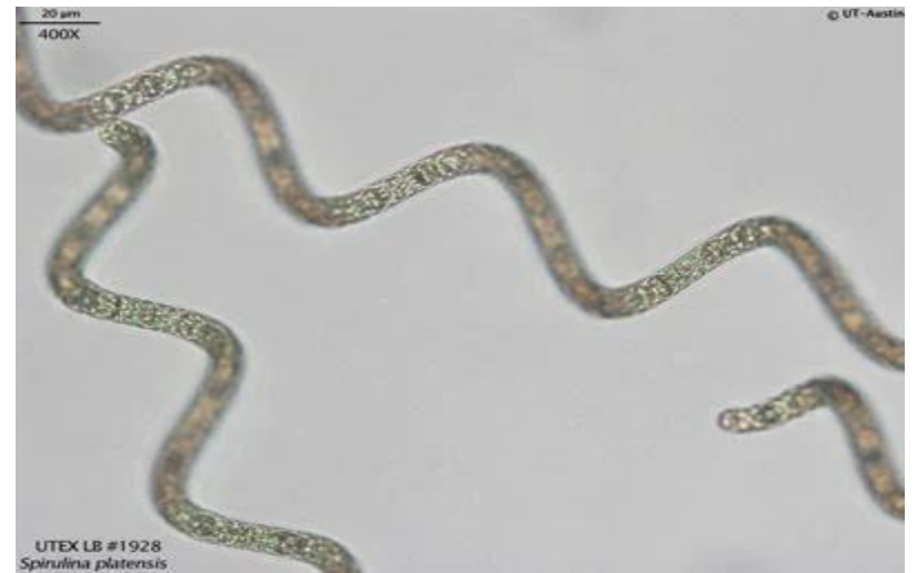
Figure 1. Microscopic view of Arthrospira platensis (UTEX, 2024)