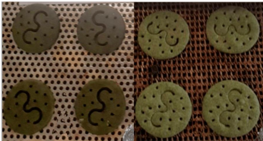
Figure 2. A. platensis added biscuit (Gün et al., 2022).

Furthermore, the incorporation of A. platensis into fermented dairy products, such as ayran, showcases its potential in augmenting both the nutritional and functional attributes of such food items (Beheshtipour et al., 2013). The growth and vitality of probiotic microorganisms are improved and their probiotic potential and nutritional value are increased when A. platensis is added to probiotic-fermented milk products (Figure 4) (Çelekli et al., 2020). This symbiotic relationship enhances the nutritional profile of ayran and highlights its probiotic effectiveness, providing consumers with a convenient and health-promoting beverage option (Çelekli et al., 2020). All things considered, the various ways that A. platensis is used in functional food recipes highlight how important it is as a nutrient-dense, sustainable ingredient that can help with a range of dietary needs and promote overall health (Birch and Bonwick, 2019).