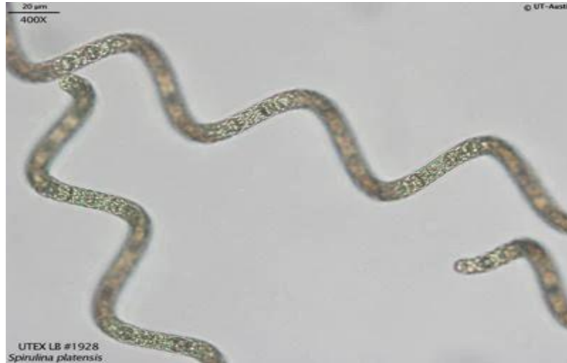
Figure 1. Microscopic view of Arthrospira platensis (UTEX, 2024)