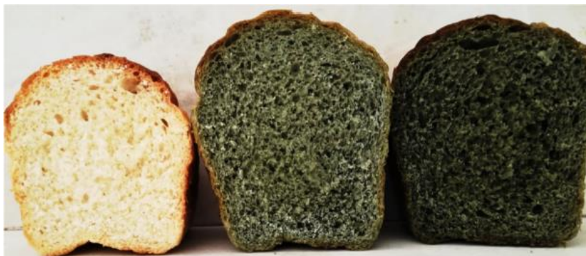
Figure 3. Gluten-free bread made from rice flour with A. platensis added instead of wheat flour (Zlateva and Chochkov, 2019).